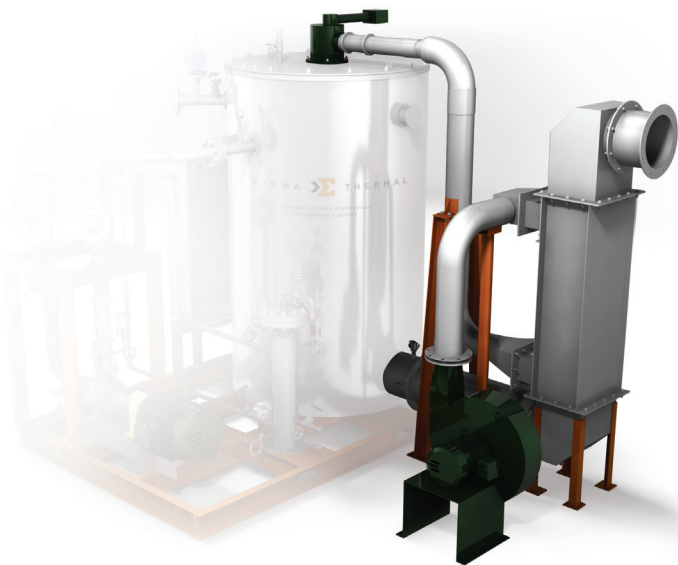
Combustion Air Pre-heat System