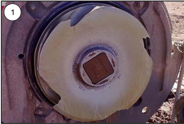
Standard hard iron impeller after 40 service days