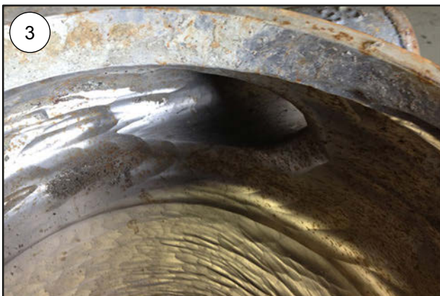
Standard hard iron case after 5 service days

(Garnet hardness: 7.5 Mohs, 1,364 HV, 800 HBN)