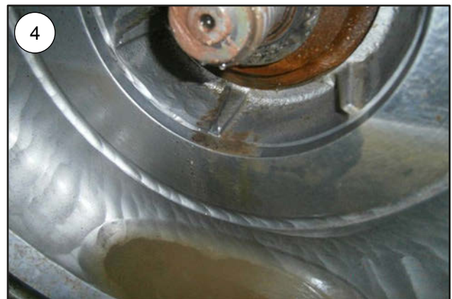
MAXALLOY® 5A case after 21 service days

Photo 3 shows the standard hard iron case after only 5 service days. Deep wear trenches are clearly visible in the case walls because of the lower fracture toughness and hardness. Significant corrosion can also be seen on the exposed surfaces.